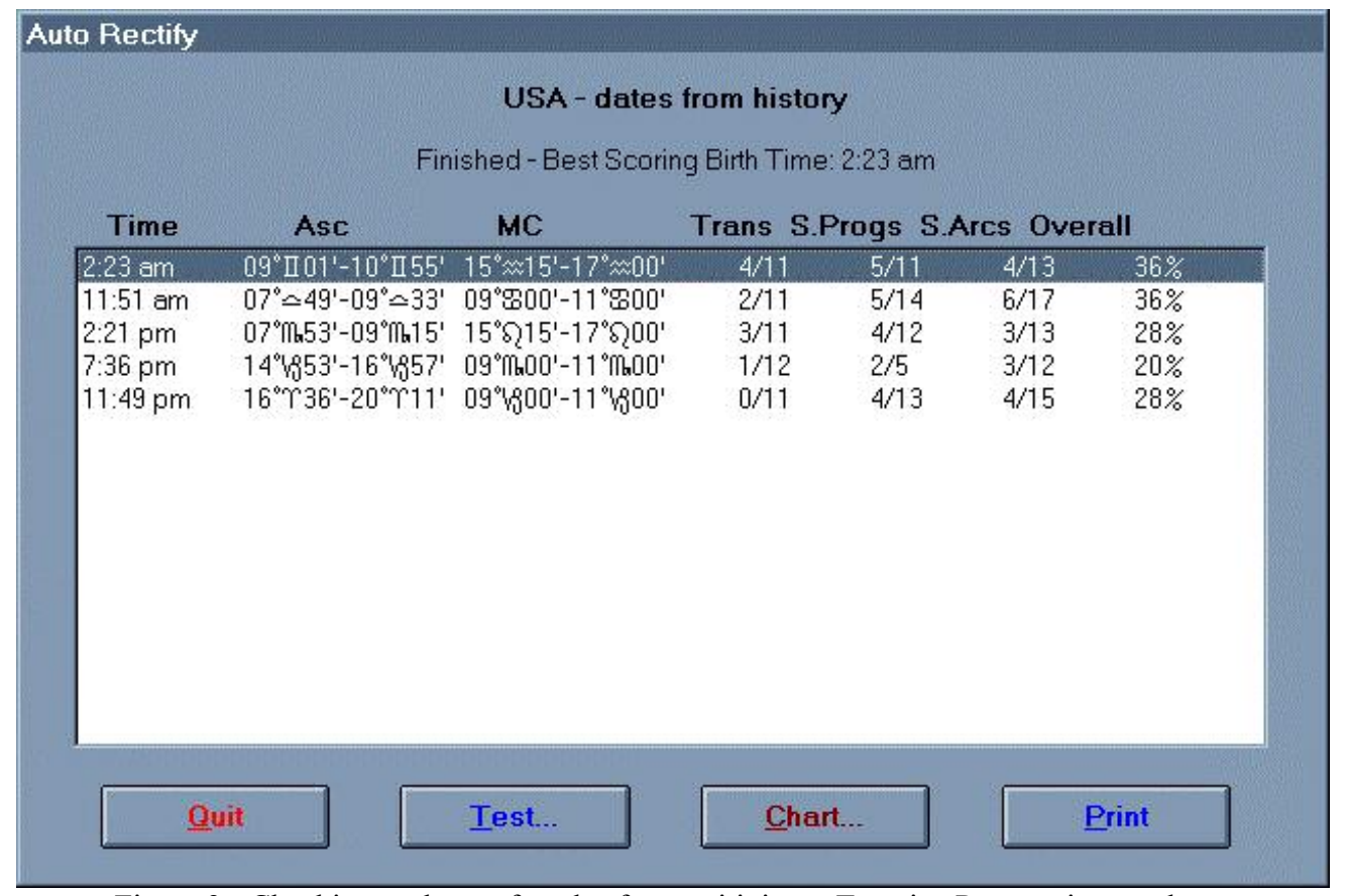
Figure 3 - Checking each set of angles for sensitivity to Transits, Progressions and Solar Arc - Jigsaw 2

Here the Ascendant of 9^0 Gemini and 7^0 Libra are proving to be more sensitive then the other possible combinations.